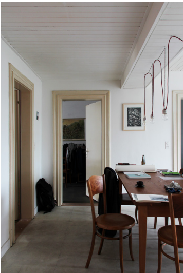
9 Gian Hodel 10 Ginevra Masiello