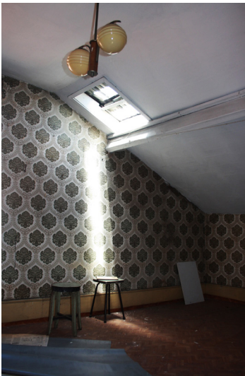
3 Chiarra Carraro 4 Carolina Biasca